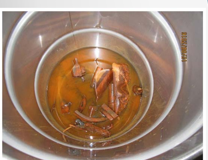
In-process iron gin product with iron pieces from Prospect Foundry in Minneapolis, MN.

Leather pieces used to process Leathered Aquavit product. Leather is soaked in aquavit product for four (4) days, then filtered using 70 micron filter paper, and bottled. Leather obtained from Tandy Leather in Minneapolis, MN and manufactured by Hermann Oak Leather of St. Louis, MO.