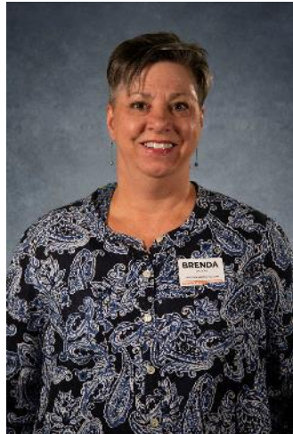
Brenda Bacon Conference for Food Protection