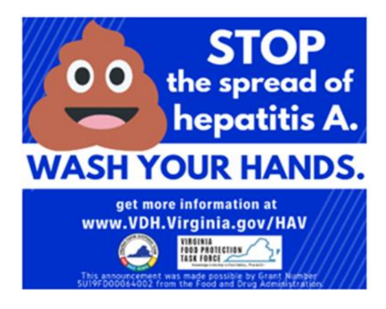
Figure 2: Virginia Department of Health Hepatitis A media image

The Coalition of Food Protection Task Forces and state food protection task force websites are web-based platforms that help share task force success stories from around the country. The following are a couple of examples: