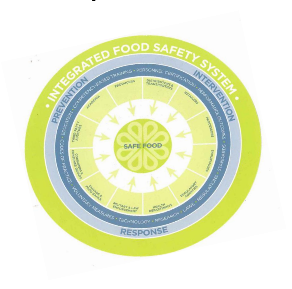
Figure 1: Integrated food safety system wheel

Active members of FPTFs may include representatives from federal, state, tribal, and local government agencies, commodity groups, food related trade associations, multiple sizes of food producers and retailers; hospitality, retailer, grocers', and food processor associations, academia, and others who collectively work together to identify and address food protection issues. Federal agencies may include regional and local FDA and USDA personnel. State and local entities may include the Departments of Agriculture, Education, and Health. Industry members may be as diverse as the regulated community within the state. The Integrated Food Safety System "wheel" ( Figure 1 ) may provide some insight into the potential partners to consider when assembling a task force: