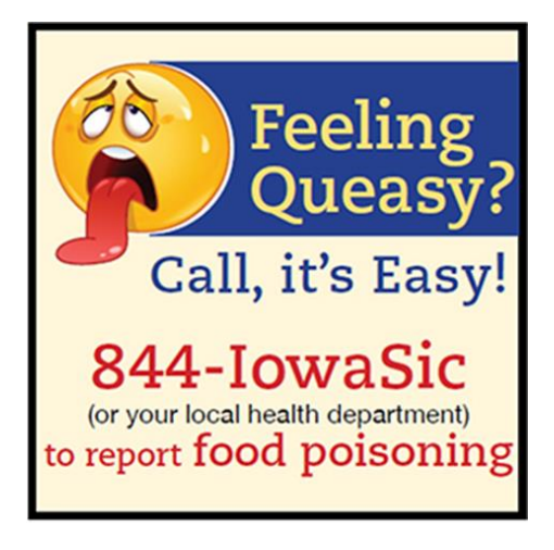
Figure 4: Iowa Food Protection Task Force's – "Feeling Queasy? – Call It's Easy!" campaign

The Washington D.C. task force presents the annual DC Health Director's Certificate of Merit Awards at its conference, recognizing DC Food Service establishments that do not exhibit any foodborne risk factors during routine inspections ( Figure 3 ). Of the 6,500 food establishments in D.C., only a select few achieve this high award each year. Food operations demonstrate food safety excellence by having no risk factor violations, priority, or priority foundation violations on their most recent health inspection report. They must also have a certified food protection manager on site at all times during operation and adhere to strict employee health and hygiene policies and practices. The establishments must be open for at least 18 months to qualify for the award and must have undergone inspection one or twice (depending on the business type) within the review period. Award winners vary from food trucks to specific chain restaurant locations, to large chain grocery stores, and even a government building snack bar.